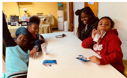
Snack time for youth at New Foundation United in Christ Fellowship (Elkhart, IN).