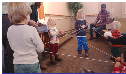
Youth from Benton Mennonite Church (Goshen, IN) participate in a children's sermon.

Belmont Neighborhood Fellowship (Elkhart, IN) incorporated the PowerPoint presentation of congregations during their offering time. As the conference staff present with them that evening, it was a joy to hear members of the congregation exclaim every time they recognized a familiar face on the screen.