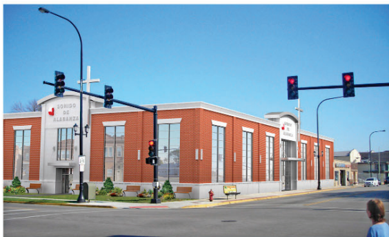
5540 WEST 25TH STREET, CICERO, IL.