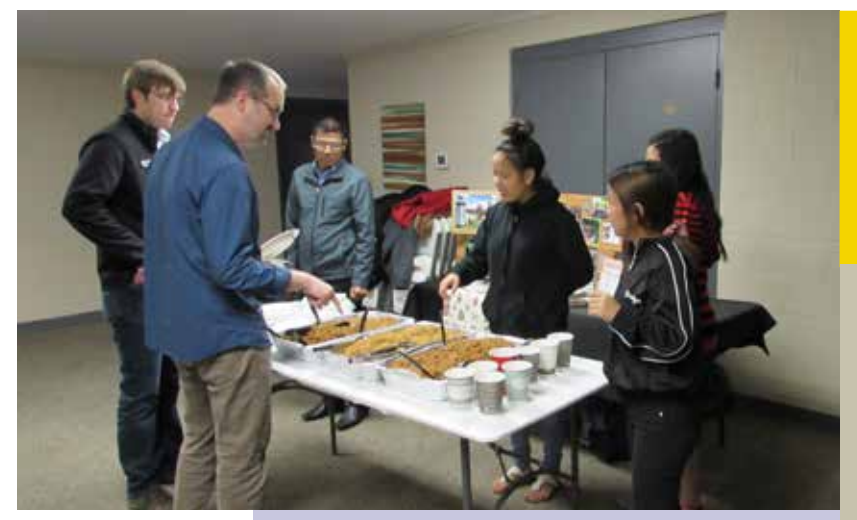
Photo above: Members of Mara Christian Church in Indianapolis, Ind., serve a meal to participants during the southern region meeting. Photo below: Congregational delegates engage with one of five prayer stations based on Romans 12.

What spiritual practices are renewing your congregation? * Learning about prayer from our brothers and sisters in Tanzania *Encouraging