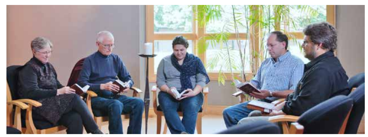
Worship during IN-MI Conference's 2016 Annual Sessions will be held in the Sermon on the Mount chapel on the campus of Anabaptist Mennonite Biblical Seminary. Photo by