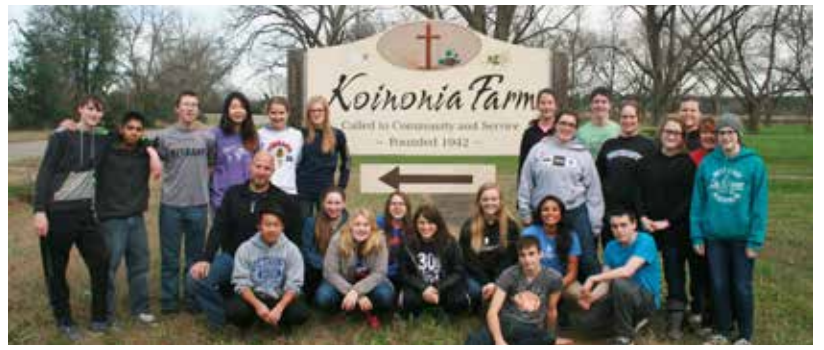
Bethany School's high school juniors visit Koinonia Farm in Americus, Ga., during their 2016 J-Term in January.

The visit was part of Bethany School's J-Term activities, sponsored the first two weeks of January. That's when students take intensive courses that expand their learning through experiential activities. This year several courses focused on ways that Mennonite values of peacemaking and promoting justice intersect with everyday life.