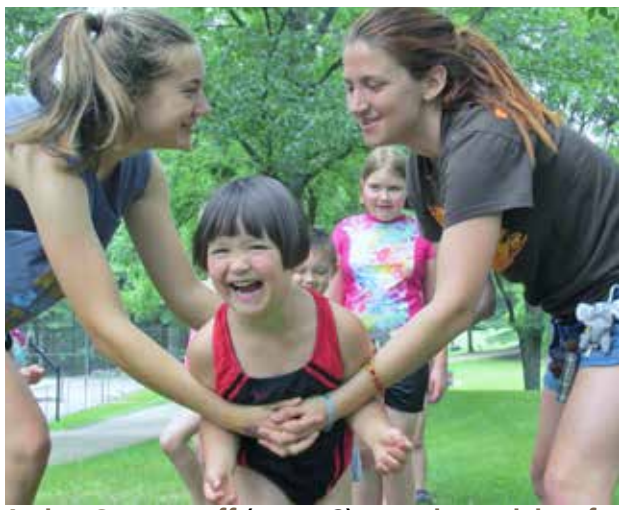
Amigo Centre staff (names?) organize activites for summer campers (names?).

Each year, since 1970, Amigo has provided a free week of camp for students from St. Joseph County, Mich. We rely on donations from individuals, churches and groups, along with our annual Golf Scramble, to cover costs of providing a week of camp for up to 80 campers. If you have contributed in the past — thank you! If you are seeking a project to donate to, please consider sending a child to camp for a week ($250-$300 per child). It can be a life-changing experience. If you would like someone to share with your group or congregation, please contact us at Amigo. We will be happy to share our stories with you. Also — if you are a golfer, consider participating in our Golf Scramble, scheduled for June 4 at Klinger Lake Country Club. Registration information is available online at <a href="https://www.amigocentre.org">www.amigocentre.org</a> Thank you for your support!