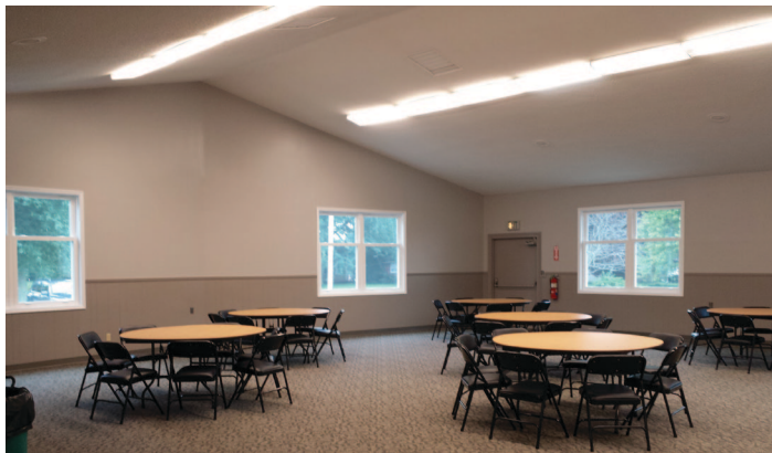
The completed fellowship hall