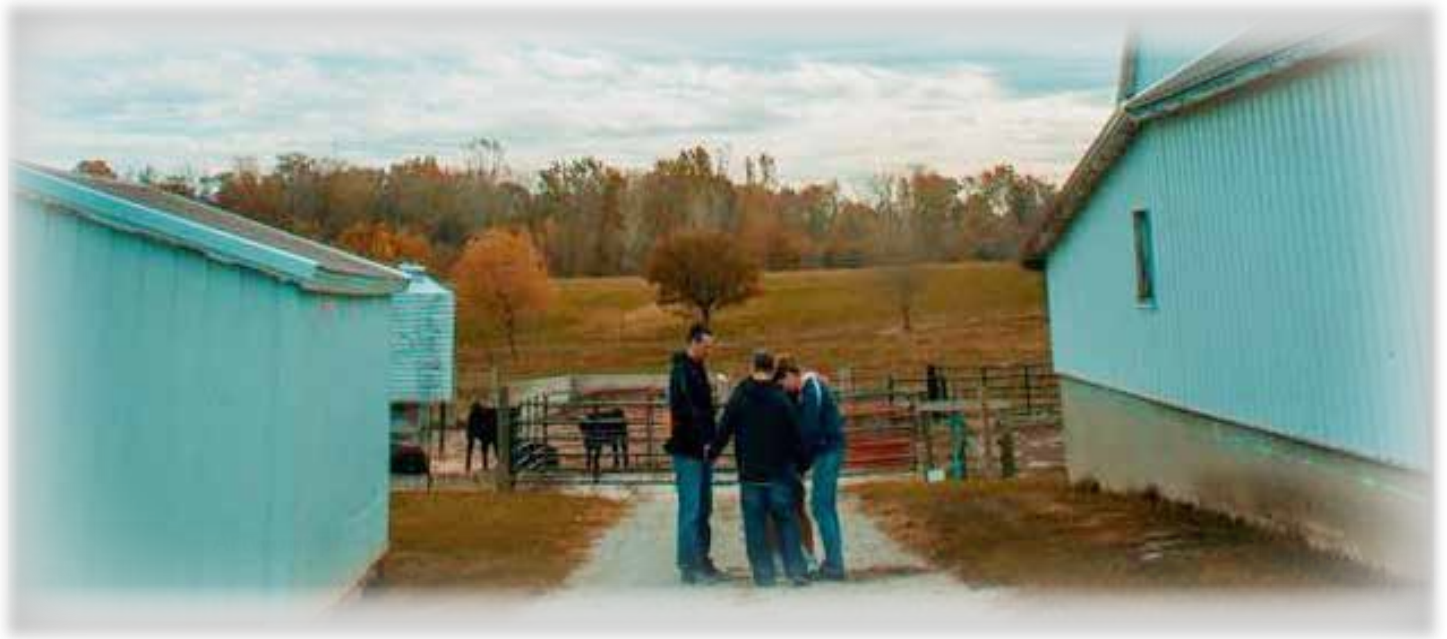
Revive teams move beyond church walls to engage with neighbors in farm yards, city blocks and factories. Photo provided