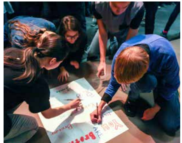
Bethany students sign a “You are my Brother” poster during the school’s weeklong focus on tackling internet pornography.

A common thread of discussion in gender-based groups was surprise at the overwhelming use in society and the acknowledgement that this is a problem for many.