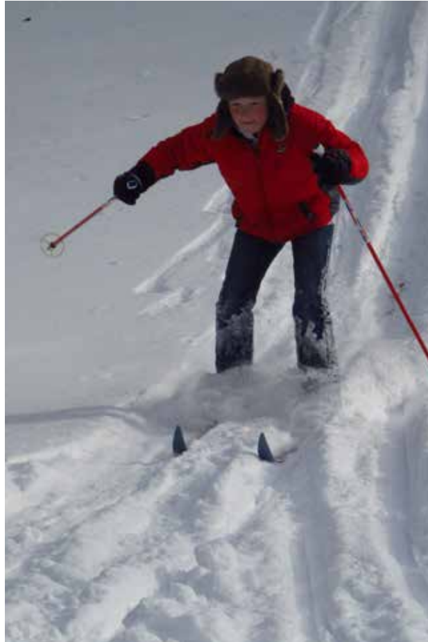
Skiing is sometimes enjoyed during winter youth retreats.

Check out the Amigo Centre website www.amigocentre.org for more detailed information and online registration.